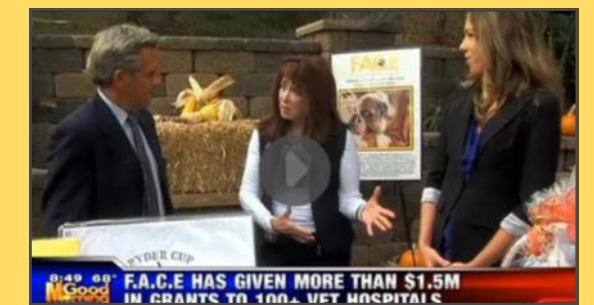
FACE featured on KUSI