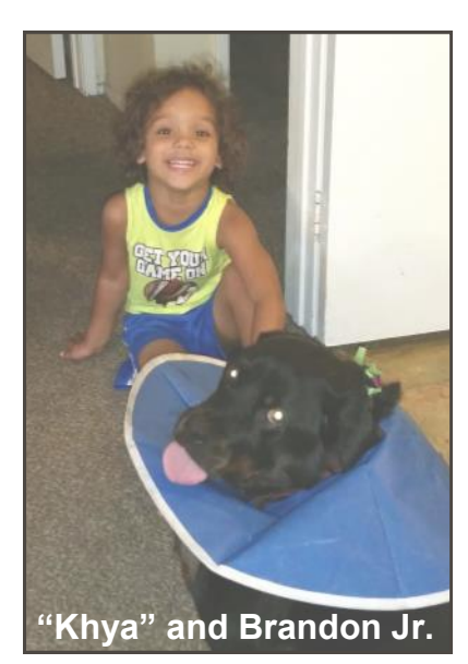
"Khya" on CBS!

As with so many animals in need of critical care, Khya deserved a second chance at life with her loving family. FACE is proud to provide that second chance and, in the process, to bring hope to families when they need it most.