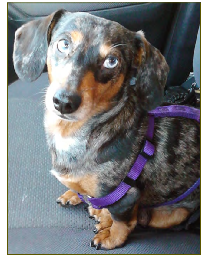
Max was suffering from a disc herniation, a lifethreatening condition common in dachshunds. FACE saved Max in February, 2013.