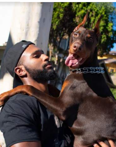
Adonis, Mushroom, & Roxy