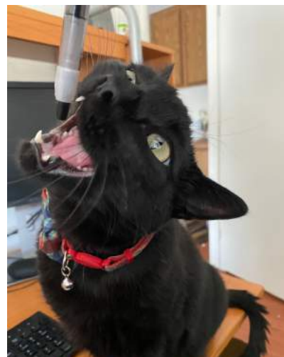
Peach, Shiloh, & Binx