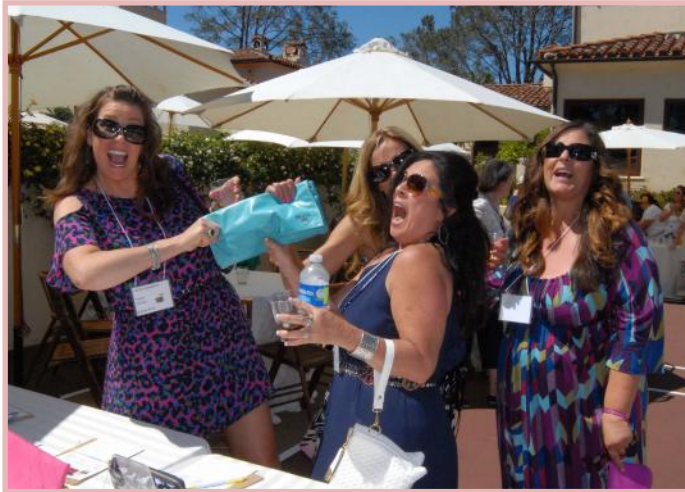
Guests vying for one of our designer bags!

Our 7th Annual Bags & Baubles was a great success! We raised over $118,000 for the animals and hosted over 400 guests. Attendees enjoyed complementary wine, appetizers, and estate tours at a beautiful private estate in Rancho Santa Fe. It was a gorgeous day to raise funds for pets!