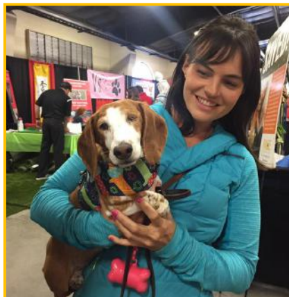
FACE grantees attending the San Diego Pet Expo