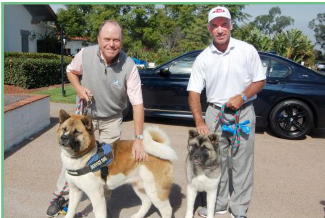
VIP guests PGA Major Tournament Champions Corey Pavin and Jeff Sluman

FACE's 6th annual Golf Tournament was the most successful yet! Players brought their pups onto the course for a great day of fun with their best friends, and at night players and guests enjoyed a brand new Yappy Hour followed by an awards ceremony, live auction, and exclusive opportunity drawings.