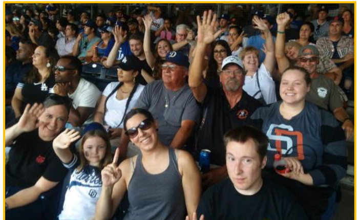
FACE staff and supporters attending a Padres fundraiser game