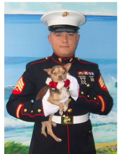
Success Story "Mojo" & owner