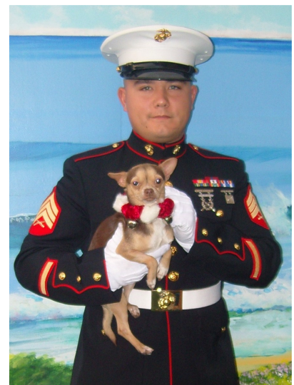
Success Story "Mojo" & owner