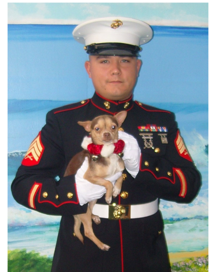
Success Story "Mojo" & owner